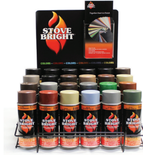
Standard Counter Top 24 Can Rack with P.O.P. Display Card 12" D X 17" W 304.8 x 431.8 mm