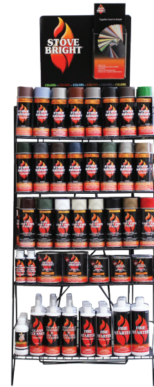
Modified Floor Display with selection of accessory products and P.O.P. Display 58" x 24" x 18" 1473.2 x 609.6 x 457.2 mm 1MJWP000121