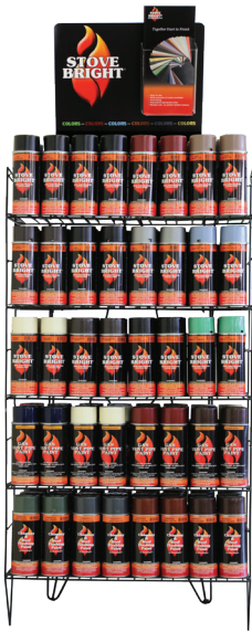
Standard Floor Display 120 Can Rack with P.O.P. Display Card 58" x 24" x 18" 1473.2 x 609.6 x 457.2 mm 1MJWP000120